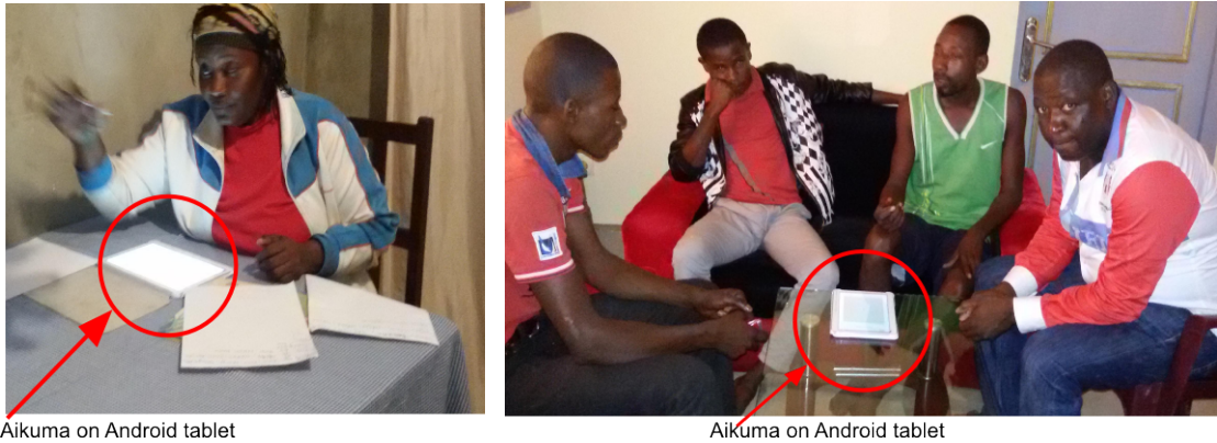
Aikuma on Android tablet