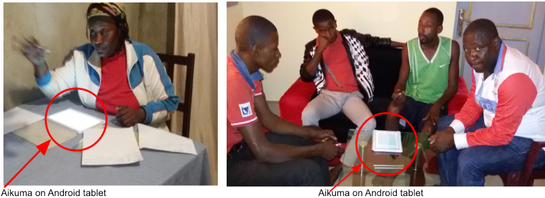
Fig. 3. Examples of the use of Aikuma on Android tablets for data collection: elicited verb conjugations spoken by a native Mboshi woman (left) and free conversations involving several speakers (right).

code has been put on the LIG forge and is accessible open source 2 for use or development on demand. Following the licence of the initial Aikuma application, the Lig-Aikuma application will be released under the same GNU Affero General Public License 3 .