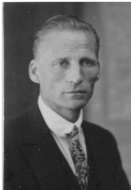
Figure 2. L.E.J. Brouwer

The other element that contributed to his fame is his work on the foundations of mathematics. Brouwer was not only a mathematician, but also a philosopher with a strong mystical accent. He completely rejected the two then current theories on the foundations of mathematics; the logicism by Russell, and the formalism by Hilbert. For Brouwer, mathematics was rooted in, and created by the human mind. Crucial is the observation of the permanency of objects during consecutive points of time. That fundamental intuitive sensation of time gives, according to Brouwer, birth to the concept of counting and the series of natural numbers. All mathematics is built on this series. The continuum on the other hand, cannot it be constructed from natural numbers, nor does the continuum consist of all numbers. The continuum is in fact the separation between two different numbers, and you can construct new numbers on this continuum, but that does not mean that the continuum is merely a collection of numbers. As a consequence, Brouwer accepted the existence of mathematical objects only when they could be constructed in a finite number of steps. This principle gave birth to his intuitionistic mathematics, in which parts of the traditional mathematics were rejected, or at least were questioned.