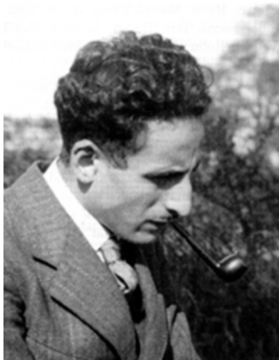
Figure 1. Hans Freudenthal 1905-1990.