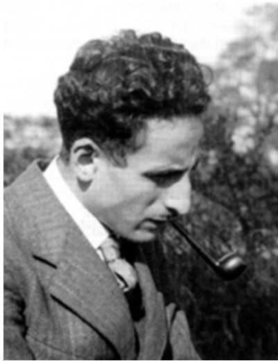
Figure 1. Hans Freudenthal 1905-1990.