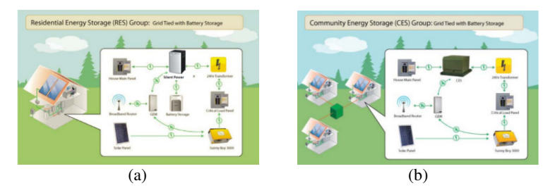
Fig.1. Residential (a) and Community (b) Energy Storage systems.

In this paper, it will be shown different energy storage systems used for residential or community applications (community of residential energy storage, CRES) (Fig. 1). The main targets of this research work are a higher efficiency, lower cost and longer life.