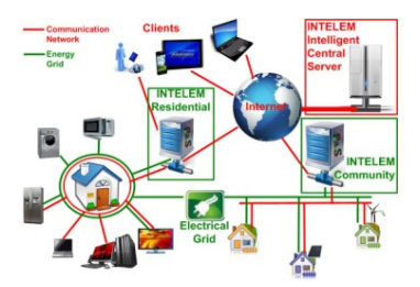
Fig.3. Schematic diagram of INTELEM Project.

EMS will be able to adapt to the environment, grid and user requirements. In this context, it can be referred the project INTELEM (Fig.3) that implements ideas related with the smart storage. In this project the smart storage is based in two systems implementing a master/slave configuration that integrated electric grids and communication networks.