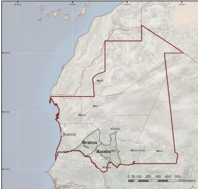
Figure 1: Location of the case study areas, the wilayas of Brakna and Assaba

To address these challenges and to identify appropriate climate change adaptation measures, the Deutsche Gesellschaft für Internationale Zusammenarbeit (GIZ) GmbH, on behalf of the German Federal Ministry for Economic Cooperation and Development and the European Union, requested a climate change vulnerability assessment, which aims to assess how the capacities to adapt to climate change in rural areas can be improved. The assessment targeted key national actors in order to better identify and design adaptation measures.