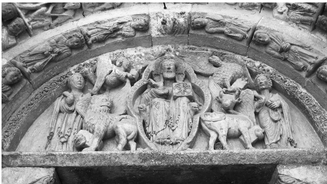
FIG. 7.7. North portal, Saint-Miguel Church, Estella (Navarra).