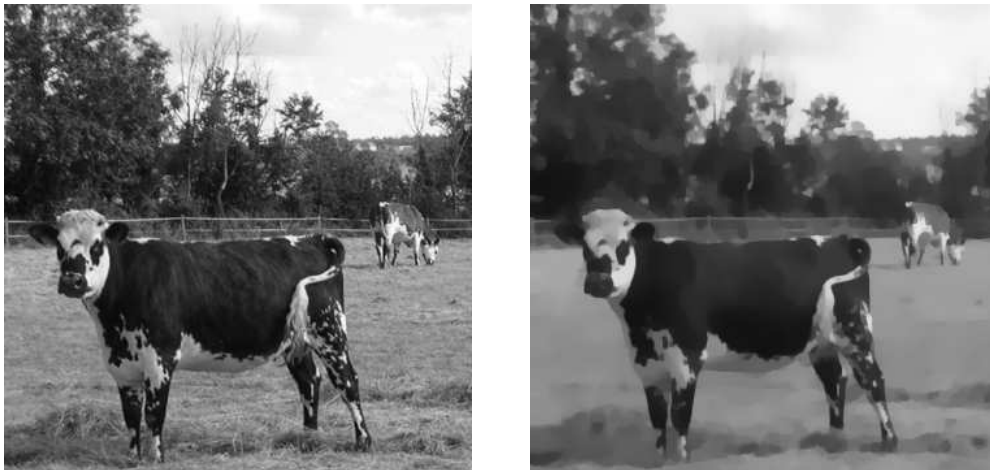
Figure 1: A 360^2 = 129600 -pixels image (with values in [0, 255] ) and the solution of (40) for \lambda = 30 , \varepsilon = 1 .