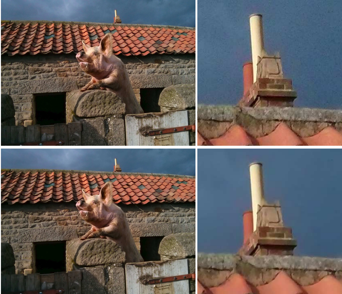
Figure 3: A 3264 \times 2448 = 7990272 -pixels image and a 360 \times 360 = 129600 -pixels crop (with RGB values in [0, 255] ), and (below) the solutions of (40) for \lambda = 10 , \varepsilon = 0.1 .

pixels image of Fig. 3 2 . The results, shown in Table 2, show that the method is also efficient with this inexact implementation (with 5 descent steps). The left part of the table shows the execution time for the small image, on the same computer as in Table 1. The time spent in each iteration is about 3-4 times longer than for grey-level images.