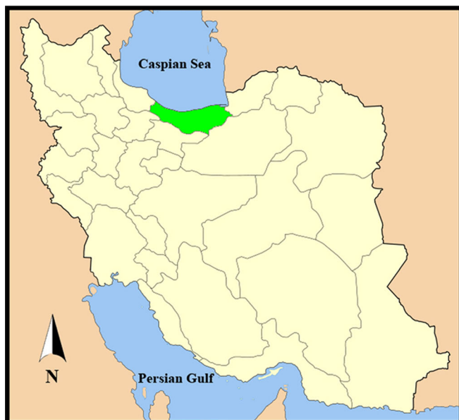
Fig. 1 Map of Iran showing the location of Mazandaran province

where ME is the machinery energy (MJ), E is the production energy of the machine (Table 1), G is the mass of the machine