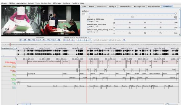
Figure 3. Labelling gaze & speech events with Elan.

Elan [10] (see Figure 3) and Praat [11] were used to semiautomatically identify speech, gaze and arm events. Behavioral models have to orchestrate these events according to the task and should be able to generate motor actions from percepts. Modality-specific gesture controllers have then to reproduce final motions from these discrete motor events.