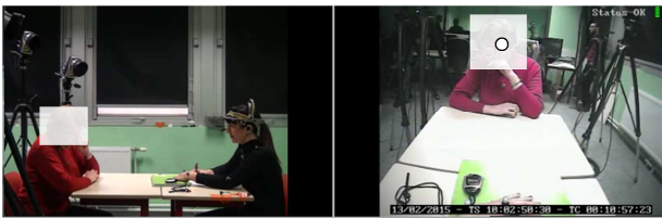
Figure 2. Visual data. Left: side view from a fixed HD camera. Right: head-related view from the eyetracker scene camera. The dot superimposed to the scene camera features the current gaze fixation point.

Each interview lasts around 20", comprising the collection of personal records, the core RL/RI protocol and final report of performance. We analyze here a total of two hours of multimodal data for five subjects, interacting with a unique interviewer (a medical one, professionally trained to conduct these RL/RI tests).