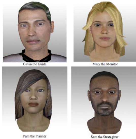
Figure 2: The four pedagogical agents in MetaTutor.

its relevancy for those subgoals, judge their learning (both for the page presented and overall), and assess how well they feel they know the information. As such, the number of metacognitive process prompts contributes more interaction between the students and Mary. Lastly, Sam the Strategizer supports the students in summarizing the content they read, to take notes on the content, coordinate the informational sources (text and diagram), and reread, if needed. The cognitive strategies prompted by Sam contribute to a notable amount of time interacting with the students.