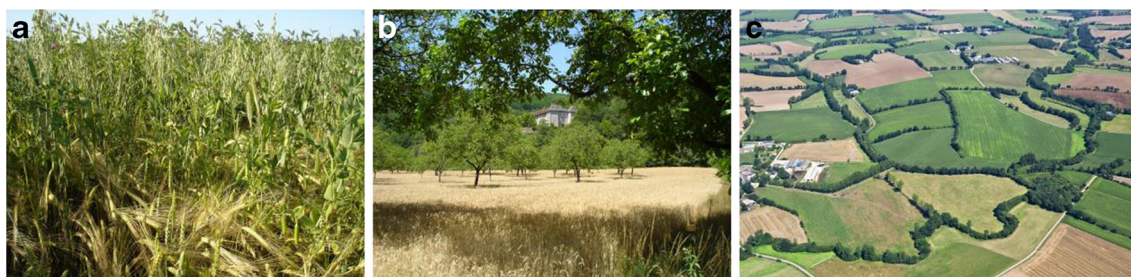
Fig. 1 Developing a a diversified cropping system, b farming system and c landscape that strongly increase provision of ecosystem services requires adaptation in supply chains or in local natural resource management. a Intercropping can be problematic for separating grains of cultivated species at harvest or in the factory; this logistical problem limits adoption of such cropping systems. b Agroforestry, based on growing woody vegetation within and/or around fields, requires specific management practices and materials; its development can require using

local processing chains for wood-based products. c Hedgerows in an agricultural landscape can help limit soil erosion, improve water quality, and provide habitats for natural pest enemies and pollinators. It is estimated that nearly 70 % of the 2 million km of hedgerows likely present in France in the early twentieth century have been destroyed. Coordination among stakeholders is necessary to ensure development of landscapes adapted to deliver expected ecosystem services, such as biological regulation and water provision