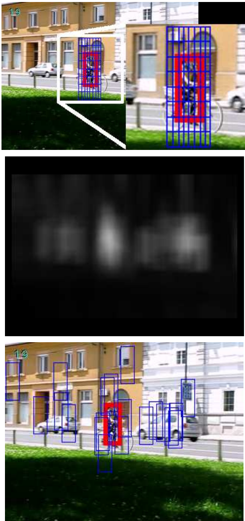
Fig. 1. Illustration of different sampling strategies of negative examples (blue). Top: traditional sampling at fixed positions within a search window around the object (red). Middle: the motion probability density function m (Eq. 13). Bottom: the proposed negative sampling from m .