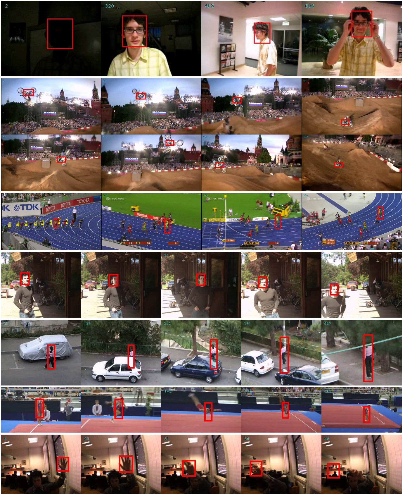
Fig. 3. Tracking results of MCT on the sequences “David”, “Motocross1”, “Bolt”, “Sunshade”, “Woman”, “Gymnastics”, and “Hand” (VOT2013). MCT is very robust to partial occlusions, illumination changes, deformations, pose or other appearance changes. In the “Woman” video, the algorithm has some problems adapting to the scale change; in the “Gymnastics” example, the aspect ratio is not adapted fast enough although the track is not lost; and in the last example the algorithm loses track due to deformation, rotation, motion blur, and low lighting.