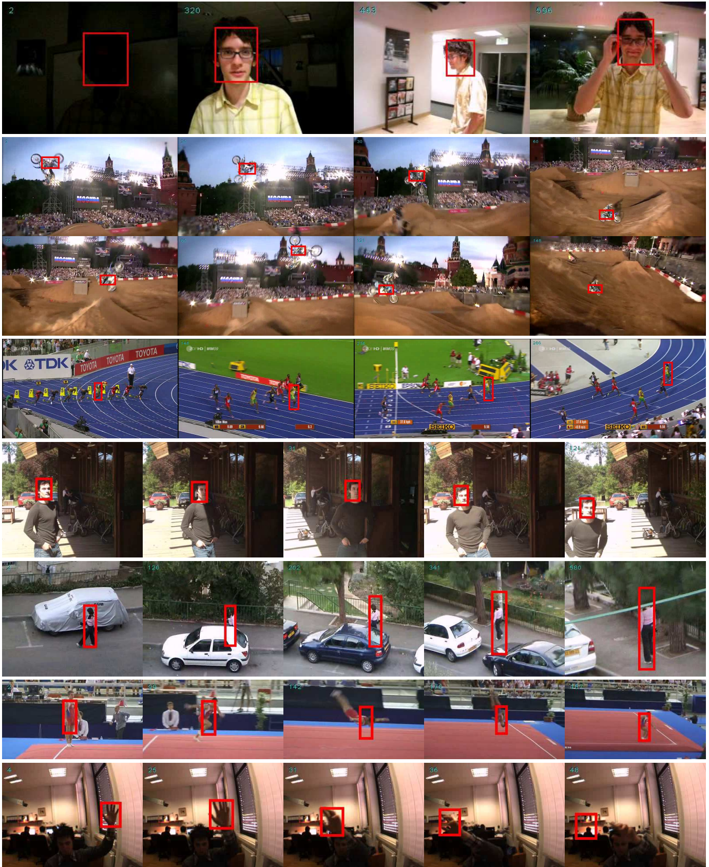
Fig. 3. Tracking results of MCT on the sequences “David”, “Motocross1”, “Bolt”, “Sunshade”, “Woman”, “Gymnastics”, and “Hand” (VOT2013). MCT is very robust to partial occlusions, illumination changes, deformations, pose or other appearance changes. In the “Woman” video, the algorithm has some problems adapting to the scale change; in the “Gymnastics” example, the aspect ratio is not adapted fast enough although the track is not lost; and in the last example the algorithm loses track due to deformation, rotation, motion blur, and low lighting.