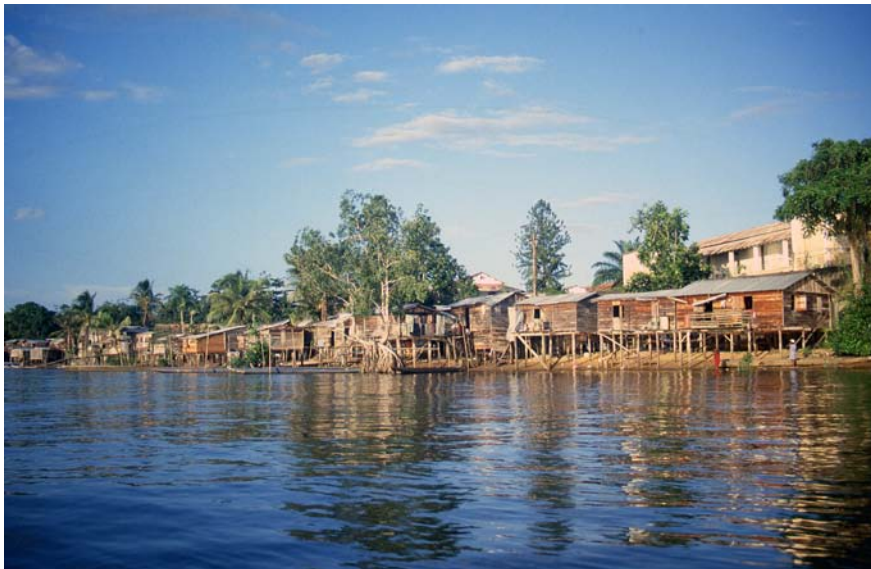
Maroon dwellings on the river banks of Saint-Laurent-du-Maroni.