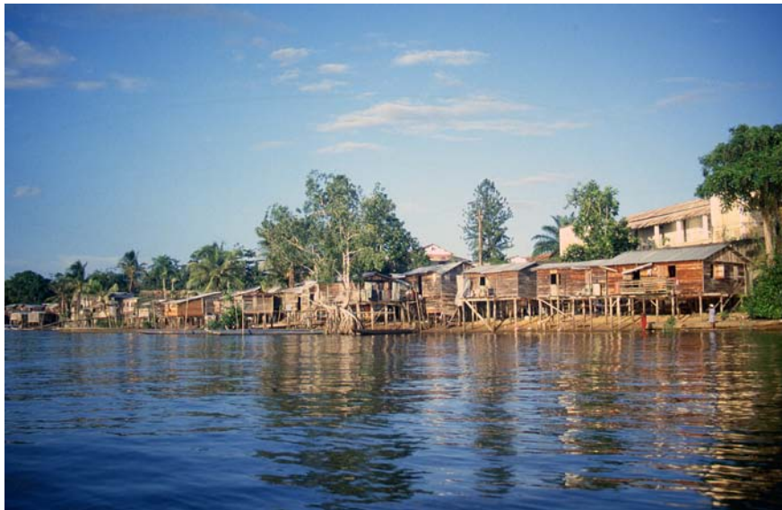
Maroon dwellings on the river banks of Saint-Laurent-du-Maroni.