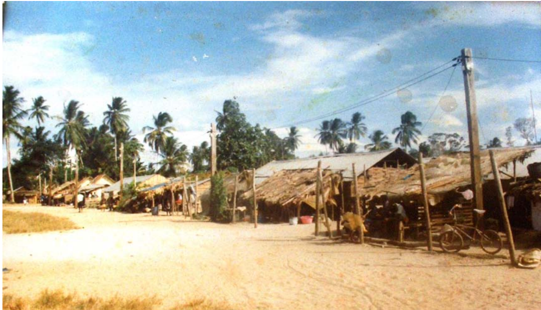
Refugee camp of Charvein, Mana.

The mayor of Mana was very much in favor of having refugees settle in his town, because he wanted to develop agriculture and to increase the population of his by then declining town. To the contrary, the mayor of Saint-Laurent du Maroni and his team were immediately against providing shelter for refugees they saw as illegitimate and invading foreigners. They associated the arrival of Maroon refugees with the rise in burglaries and violence in the town, despite the fact that police said the perpetrators of these acts were mostly “non-refugee Surinamese”. A growing feeling of insecurity among the town’s Creole population was expressed through demonstrations against insecurity and against the refugees. The term refugee became increasingly synonymous with “Maroon”, even though around 1,000 Amerindian refugees also lived there, and even though Maroon migrants had arrived there long before the war 6 .