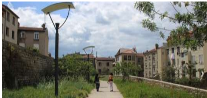
Figure 3: Point of view in the interior of block.

The architect knew how to highlight his capacity to have a global vision on the project, allowing him to be: the interface between the complex project ownership and the spatial realities; an important stakeholder throughout the project : from the definition of the operational frame of the constructive details, with the period of construction site. The thinking of all steps of project process allowed to limit expenses and to remain in the projected budget.