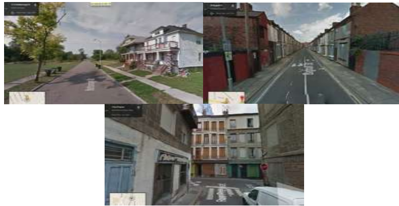
Figure 1. The different perceptions of the vacancy. Detroit (Chalmers district), Liverpool (Anfield district) and Saint-Etienne (Tarentaise-Beaubrun-Severin district) between 2013 and 2014.

“live” with these abandoned spaces (Anizon, 2010). The perception of empty can vary according to urban morphology. This distinction is perceptible between European and American cities (figure 1). The spatial impacts of this process accentuate or allow several urban issues (social, environmental, security, hygiene, etc.) to emerge. For example, abandoned spaces can become impassable, participating in the spatial fracture of the city and the isolation of individuals. Abandoned buildings often become place of squat and traffic; and their fragility can threaten nearby inhabitants and the housing (Oswald, 2005).