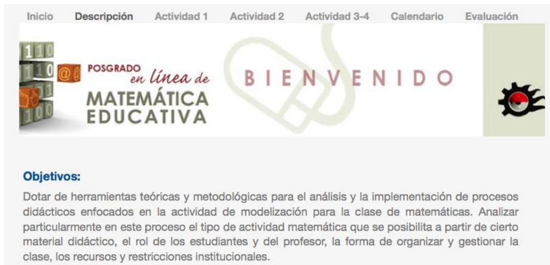
Figure 1: Description of the PISM course on Moodle

profession that guided the design and development of this course are related to the teaching of mathematical modelling: how to analyse, adapt, develop and integrate a didactic process related to mathematical modelling into teaching practice; how to disseminate a didactic process based on modelling and ensure its long-term institutionalization; which are the difficulties to overcome; what didactic tools can help teachers to make this possible; what new questions emerge in the implementation and how to best deal with them. To approach these questions, we chose a case study on sales forecasting that was carried out and analysed with first year students of mathematics for business and management (Serrano, Bosch & Gascón, 2011). The organisation and results obtained in the four activities of the course are discussed in the following paragraphs.