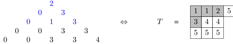
Fig. 2: The correspondence between the k -th line of a Gelfand-Tsetlin pattern and sub-tableau of an SSYT consisting of the entries \leq k . Here \lambda = (4, 3, 3, 0, 0) and y^3 - \delta_3 = (3, 1, 0) .

patterns of n rows and entries no larger than m . Those, on the other hand, are in bijection with semi-standard Young tableaux (SSYT) T filled with the numbers 1, \dots, n and shapes \lambda (corresponding to the positions of the right-most horizontal lozenges as in Figure 1) that fit in the m^n rectangle, i.e. \lambda_1 \leq m . The positions of the horizontal lozenges on the k -th vertical line are simply the entries on the k -th row of the Gelfand-Tsetlin pattern. These correspond to the sub-tableaux of T occupied by the entries which are no larger than k . See Figure 2.