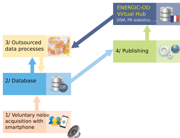
Figure 1: Conceptual model of the OnoM@p system.

ment of dedicated tools, stands for a promising capitalization framework. Environmental noise data can be recorded by the citizens who have sometimes the opportunity to brand their noise data with some associated perceptive feedbacks. These information are a valuable resource for both the scientists and public authorities since they provide a low-cost alternative solution to simulations or fixed sensors network monitoring while keeping the citizen at the heart of both the research and action plans.