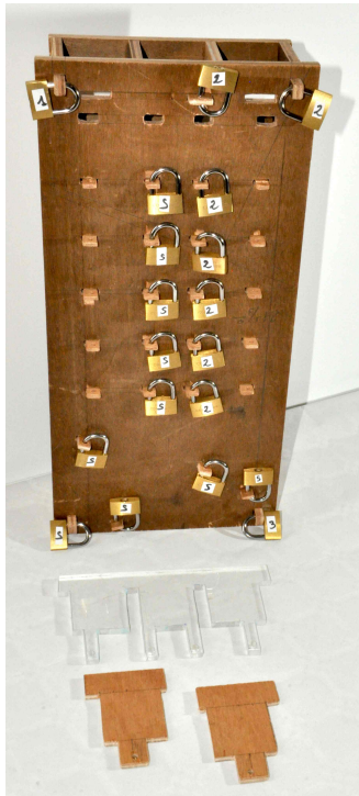
(a) The Woodako box after the bid of bidder number two.