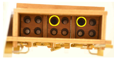
(d) Seller verifiability (i.e. view from bottom).