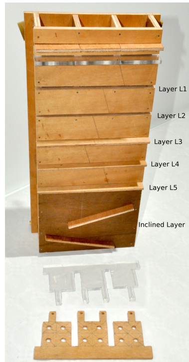
(c) The Woodako box after two prices have been tested.