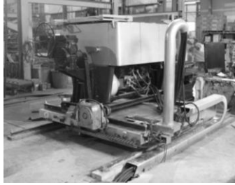
Fig. 1: Magnetodynamic mixer-batcher for preparation and pouring of aluminium alloys

Using ratios (9)–(12), it is possible to optimize material & power consumptions and to provide high quality of production at casting processes with application of magnetodynamic equipment for preparation and pouring of alloys. There is developed multifunction casting MHD-complex for manufacturing of high-quality aluminium castings. The complex is able to work effectively in different being casting technologies. The main device of the complex is the magnetodynamic mixer-batcher (Fig. 1) that provides advanced technical parameters (induction heating, electromagnetic pressure, and mass flow rate at electromagnetic stirring & pouring of aluminium melt).