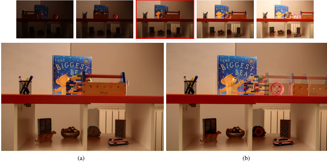
Fig. 2: Fused images performed by, (a) non-local exposure fusion (NLEF), and (b) classical exposure fusion [7].

is defined as the Sum of Squared Differences (SSD) between the values of the patches in the respective luminance images, that is,