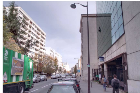
(d) Fusion with [18], (116 sec).