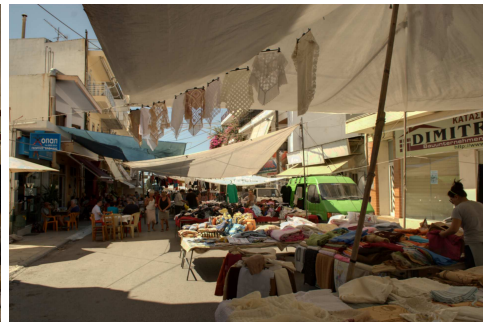
(f) Fusion with [18], (394 sec).