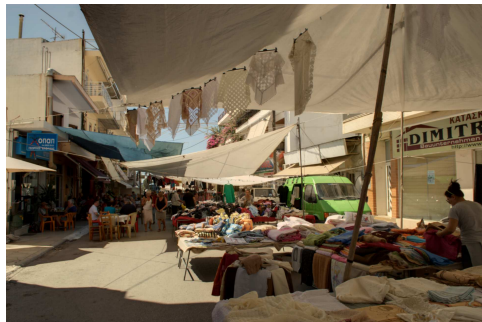
(e) Our Method - NLEF, (68 sec).