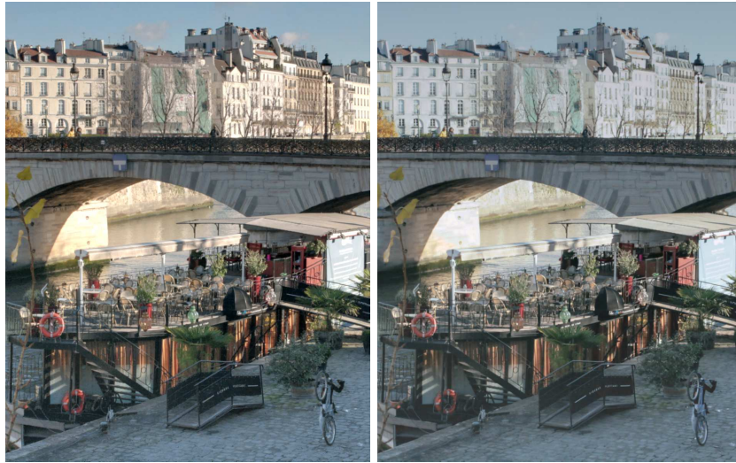
(a) Our Method - NLEF, (24 sec).