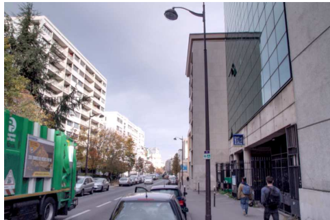
(c) Our Method - NLEF, (18 sec).