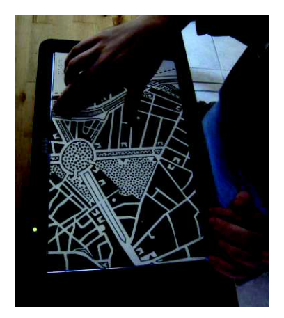
Figure 2. Touch the map! allows blind users to interact with a tactile map and retrieve names, distances and details using gestural interaction technique. Retrieved from (A. Brock et al., 2010).

Similarly, haptic devices such as a joystick or a phantom device can be used by a visually impaired user to explore a virtual map