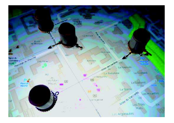
Figure 4. Tangible objects on the collaborative table. Here the objects represent either buildings or crossings. Their position

We designed cylindrical objects with tactile cues for orientation. They are fillable with lead, which proved to be an efficient way to quickly modify their weight and make them stable. These objects are tagged and their position and current state (e.g. detected by the system) is continuously tracked by the system. In order to construct tangible maps, we also needed lines and areas. We added retractable reels on the objects. The end of the reel is magnetic and can easily be attached to another object. These connectable objects are used to "materialize" points, lines, and areas on the map (see Figure 4). We are currently evaluating the usability of these objects in our different scenarios.