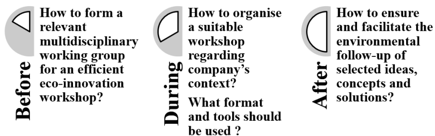
Figure 1. Research questions studied for an adapted and efficient eco-innovation workshop

In this section, inspirations for the proposed method from prior scientific literature are reviewed. Based on this state-of-the-art and regarding company's context (needs, constraints and features), research questions have then emerged to adapt existing eco-innovation workshop process to a new one which best meets company's context. Thus, investigations have been performed at three different stages of the workshop organisation (before, during and after the workshop), as presented in Figure 1.