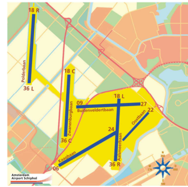
Figure 1. Schiphol Runway Lay Out

For the study presented here, we will use the example of the runway system and the mode of operation of Amsterdam Airport Schiphol. The airport operates at most times several runways simultaneously. The airport's lay out is presented in Figure 1. Schiphol's preference is to use runways in segregated mode as the use of separate runways does not require special measures for separating traffic at the runways. For indicating