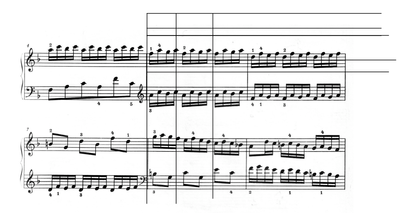
Figure 2 <sup>7</sup> (The horizontal lines represent pitch, while the vertical lines divide the duration into equal sequences.)

greatest assets is that it is not only a system, but above all, a way of organising music and of representing it through values and symbols.