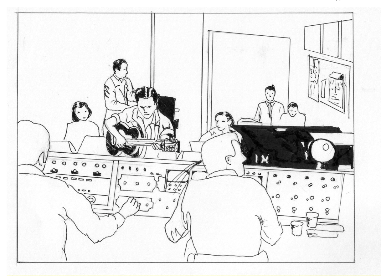
Figure 5 Reproduction of a scene from Richard Thorpe's film Jailhouse Rock (1957). Drawing by Valentine Lellouche.