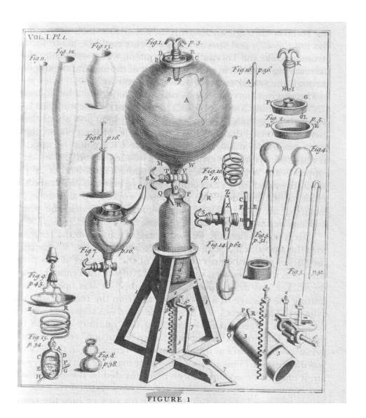
Figure 3 Boyle's Air Pump and instruments

Even the austere theorist Newton resorts to machines of his own invention to validate his theory of universal gravity [Jacob & Stewart 2004]. Inseparable from the machine, the laboratory – which will soon become a "scientific laboratory" – becomes the site where nature and its laws manifest themselves. The machine becomes the active principle of knowledge , to the great displeasure of the Continent's Cartesians (represented in England by Hobbes), who consider that the machine's function is to control the accuracy of calculations and to serve as a referent in the process of observation of external phenomena.