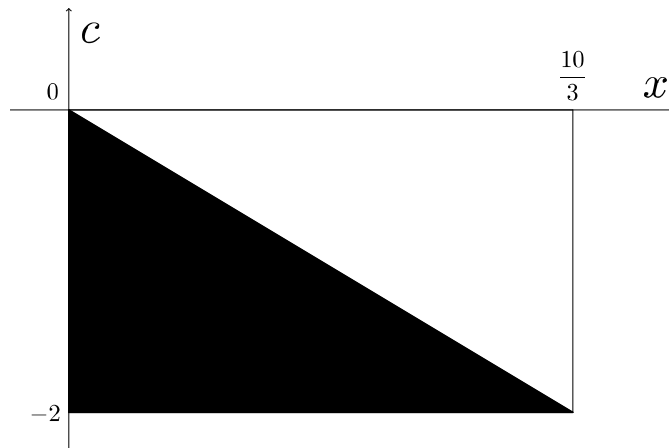
Figure 2: Compact set K .