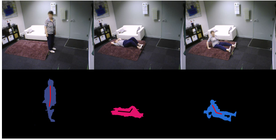
Figure 4: Event detection, results

on comparison of two histograms i.e. key pose frame histogram and histogram of frame in hand (Barnachon et al., 2012). The histograms were then compared with the Bhattacharyya distance and warped by a dynamic time warping process to achieve their optimal alignment (Barnachon et al., 2014). Bhattacharyya distance is calculated using: