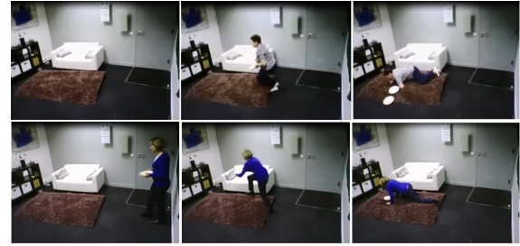
Figure 2: Excerpt of 2 video records showing each the fall of an elderly participant.

Ideally scenarios should be played by elderly people. However, it is cumbersome to find elder person who is capable and willing to play such scenarios (refer Section 2.2.). To record realistic data (but not necessarily played by elder person), people under 60 were recruited. Then, these volunteers were instructed to wear an equipment i.e. old age simulator (see Figure 1). Old age simulator hampered mobility, reduced vision and hearing. Overall 17 participants were recruited (9 men and 8 women) with mean age of 40 years (SD 19.5). Among them 13 people were under 60 and worn the simulator.