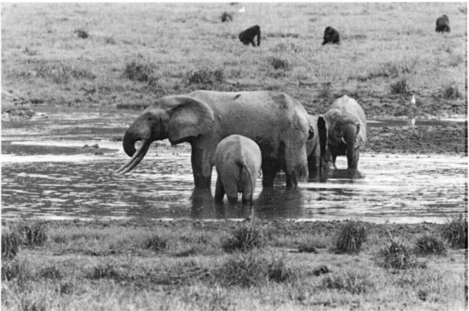
Figure 3. — (a) Elephant, buffaloes and a sitatunga adult male at Maya Nord; (b) a group of elephants drinking and eating soil; in the background, gorillas are eating herbs.