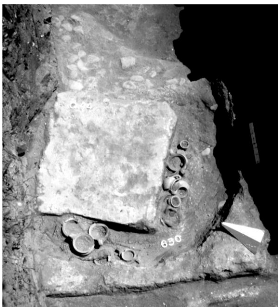
Fig. 1 – Votive deposit DV635, vessels of the external set, US 360 (Photo M. Marchesino, Archivio Soprintendenza Archeologia della Puglia - Centro Operativo per l’Archeologia della Daunia).

vessels (US 635, nn. 11-22); 4 miniature ollae , 7 krateriskoi and a small jug; the last layer included 10 vessels (US 635, nn. 1-10); 4 miniature ollae , 2 krateriskoi and 2 small jugs. At the bottom, under the pots, there was “ uno strato potente di terreno cineroso e ossa bruciate ” (“an earthen stratum with ash and burnt bones”, M. Mazzei, Archivio Sop. Arch. Puglia, Centro Operativo per l’Archeologia della Daunia).