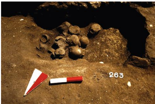
Fig. 3 – Votive deposit DV263 (Photo M. Marchesino, Archivio Soprintendenza Archeologia della Puglia - Centro Operativo per l'Archeologia della Daunia).