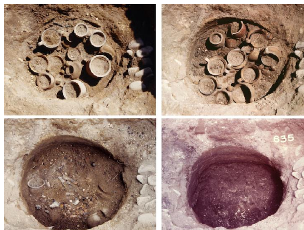
Fig. 2 – Votive deposit DV635, internal layers (Photo M. Marchesino, Archivio Soprintendenza Archeologia della Puglia - Centro Operativo per l’Archeologia della Daunia).

Some of the vessels still conserved their original filling composed by strongly carbonaceous and ashy earth with traces, perhaps, of the rites performed at the time of the deposit’s sealing.