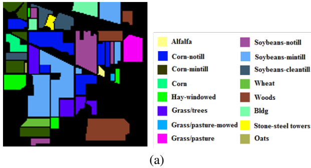
Fig. 1: Indian Pines image. (a) Ground truth reference map and legends. (b) SVM-MCS-CF classification map. (c) SVM-UCS-CF classification map