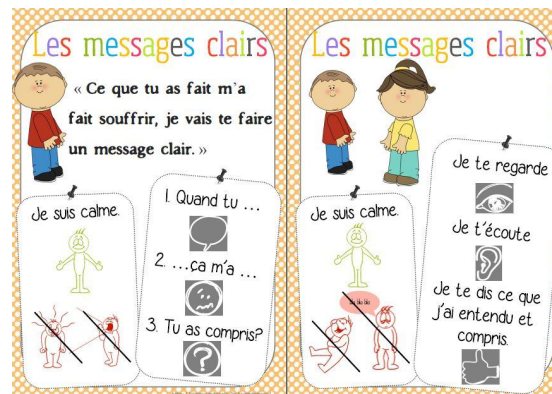
Protocol of the ‘Clear Message’ 2

Comparison of the two protocols reveals that the approaches to conflict management in France and Britain are at variance. Restorative Practice envisages the intervention, initially, of a third person who will lead the exchange in the framework of a Restorative Conference, but eventually give way to the individuals to manage themselves. In contrast, the technique of the Clear Message takes as its starting-point the ‘I’ as an active subject; the notion of mediation by a third person only appears in the French protocol when the clear message is not received.