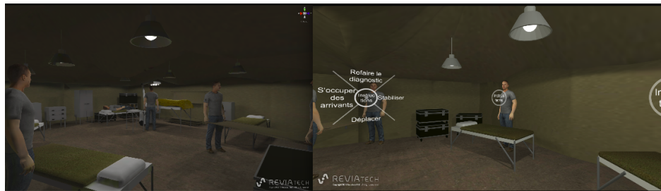
Figure 1. The Virtual Field Hospital - designed by Reviatech

The virtual environment reproduces a Field Hospital, located in a tent, with regular/standard medical material in cupboards. The victims are already placed on beds and the medical staff is scattered in the room, taking care of the victims. The profiles of the victims and medical staff can be changed by the trainer between training sessions to optimize adaptive skills of the learner. Figure 1 gives an overview of this virtual environment.