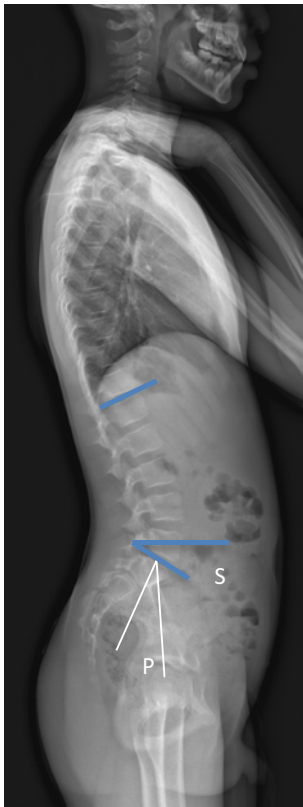
Fig. 1 Spino-pelvic parameters measurement on standing sagittal view of the spine. Lumbar lordosis (LL) is measured between the superior endplate of L1 and S1. Sacral slope (SS) is measured between the horizontal line and the sacral plateau. Pelvic incidence (PI) is measured between the perpendicular line to the sacral plateau and the line passing by the midline of the center of femoral heads

Each AIS patient enrolled in the prospective study underwent a standardized MRI protocol before surgery, 3 months after surgery and at least 2 years after surgery. To minimize the bias of diurnal variations of disc height and nucleus size, MRI examinations were scheduled in the morning (patients were called at the latest at 8:00 am) and patients were asked not to have any physical activity. Acquisitions of the full spine were performed using a turbo spin echo T2-weighted sequence in the sagittal plane on a Magnetom Vision 1.5 T. (joined cuts of 3 mm). Disc volumetry was extrapolated using custom-made image processing software developed with Matlab® (Mathworks®). The process is detailed in Fig. 2. Using our new software Biomechlab® (Laboratoire de Biomécanique, Toulouse, France), a semi-automatic detection of the contours of each lumbar disc was performed. The external limit of annulus fibrosus and nucleus