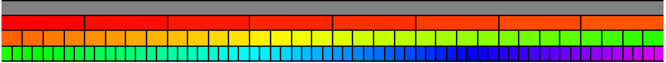
Fig. 4. Color code used to show our hierarchical segmentation results for a 3-deep tree where nodes in 0-th, first and second layer have respectively 8, 4 and 2 children each. Each node corresponds to a different color of the HSV colormap.