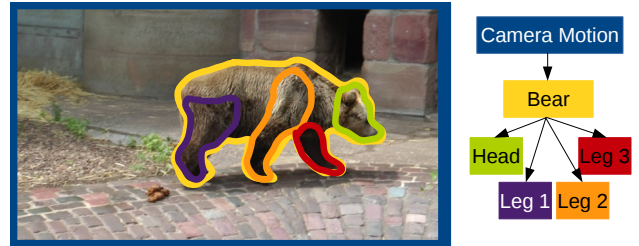
Fig. 1. Example of hierarchical motion representation of a dynamic scene. The full apparent motion of a point on the head of the bear is given by the composition of, in turn, the motion of the camera, of the bear body and of the bear head.

Hierarchical motion decomposition of a scene is a process that can be useful for a number of applications in video processing. For instance, complex rotoscoping in video post-processing for the film industry requires to label by hand different independent moving objects and their moving parts. Current automatic solutions to this problem only focus on a single region and usually do not take into account mid-level motion dynamics of scenes [1, 2, 3]. Furthermore, one could think of new ways to propose spatio-temporal regions as can-