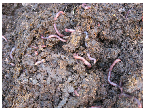
Fig. 1 Vermicomposting: the cattle manure is being digested by earthworms

From the aforementioned facts, this paper hypothesized that the digestion of cattle manure by earthworms would lead to the fuller use of the nutrients in this waste, with plentiful earthworms being obtained. However, it remained uncertain whether applying this remainder compost product to fields would generate equal or greater yields and more economic benefits than applying traditional compost in agricultural system. Therefore, this paper conducted a study about the same cattle manure treated by vermicomposting and traditional composting, and their remainder valuable compost products were applied into the fields, respectively. The aims of the investigation were as follows: (1) to investigate effects of vermicomposting and traditional composting on nutrients of the cattle manure; (2) to investigate maize yield in plots fertilized with cattle manure vermicompost and traditional compost, respectively; and (3) to compare the inputs and outputs of the two different systems (cattle manure-vermicompost-maize system, cattle manure-traditional compost-maize system) comprehensively, and determine if the field application of cattle manure digested by earthworms generated greater economic benefits.