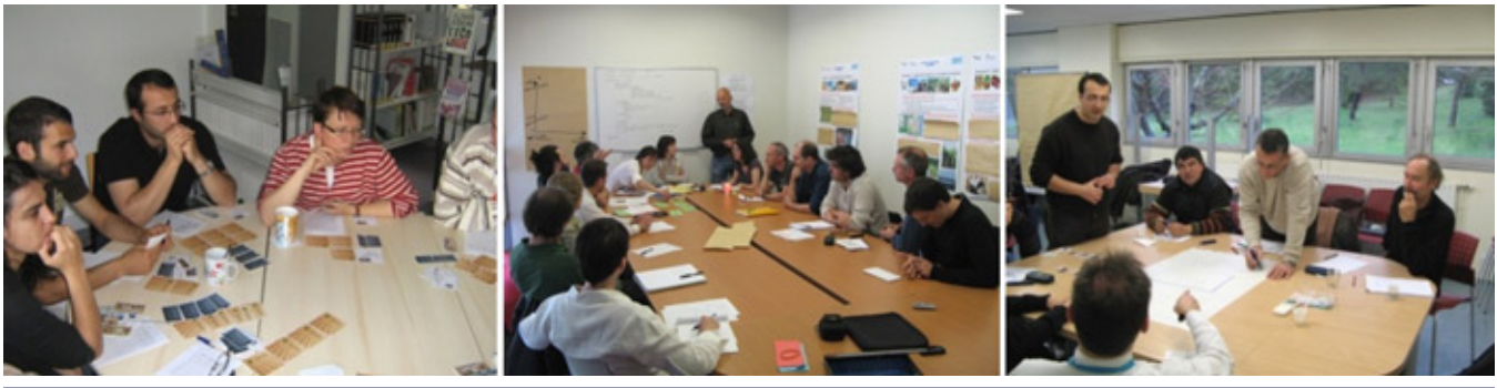
Fig. 1. Illustration of the simulation phase, where participants role-play a participatory workshop.

evaluation of the SCoP. Finally, we discuss to what extent such a CoP can help in coping with the key challenges related to participatory processes in NRM mentioned in Table 1, and outline some issues for future research and practice.