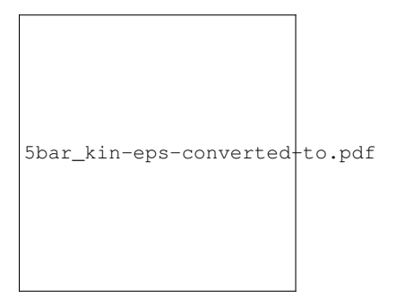
Fig. 3: Prototype of the five-bar mechanism and parametrization scheme