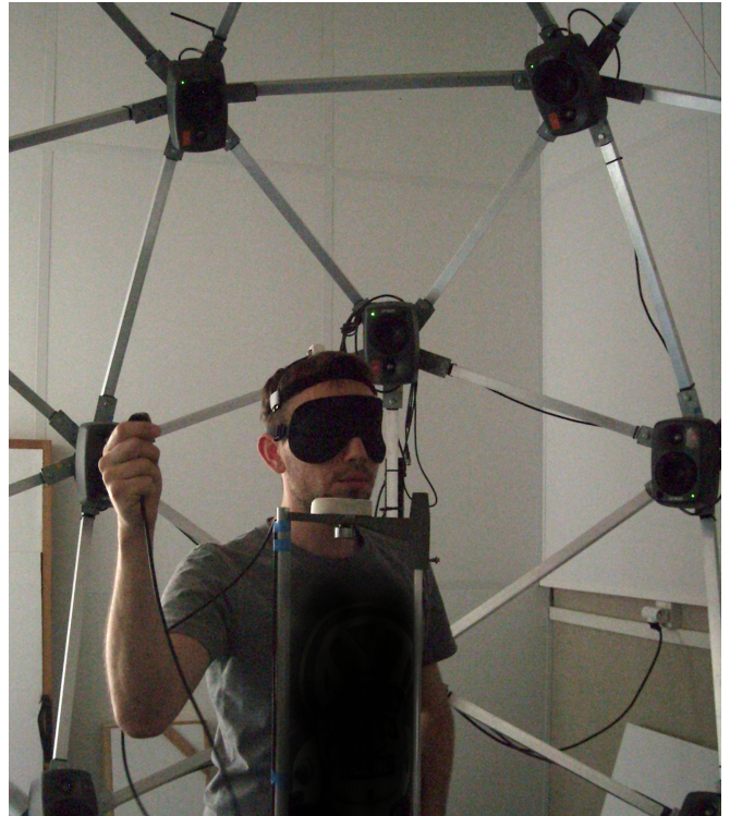
Figure 2: Picture of the localization experiment.

The analysis of localization performance, which was originally recorded in standard spherical coordinates (azimuth and elevation), was performed using the interaural polar coordinate system (see [Morimoto et Aokata, 1984]). In this coordinate system, azimuth and elevation angles are transformed into lateral and polar (or rising) angles, with the polar angle rotation axis being the interaural axis. The direction of a vector between the head center and a point on the sphere is expressed by two angles: the lateral