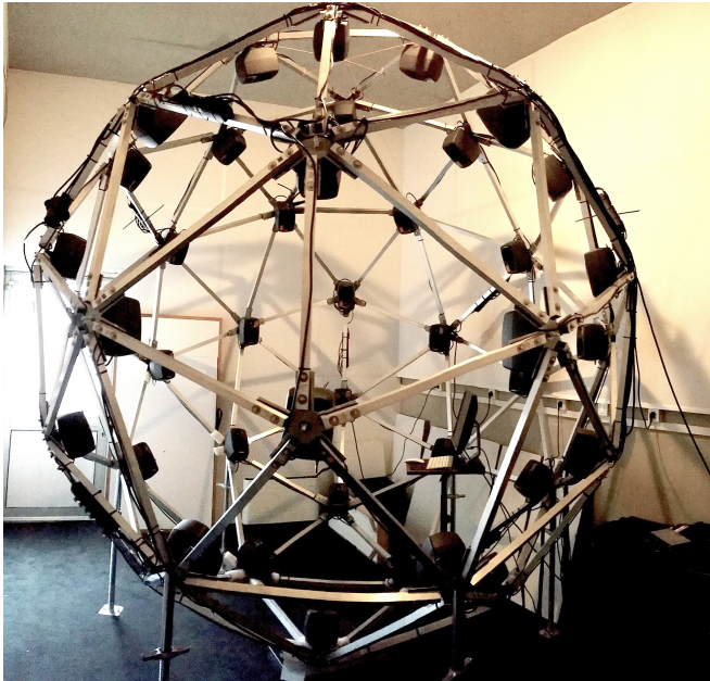
Figure 1: Picture of the spherical loudspeaker array.

A geodesic sphere is a discretization of a sphere with a complex network of triangles. It consists of lightweight rods or poles joined so as to form interlocking polygons whose vertices lie on an imaginary sphere. It can be entirely defined by its frequency and its diameter. The higher the frequency, the more complex the network of triangles, and the more closely the geodesic structure approximates the shape of a true sphere. A geodesic sphere of frequency F1 is an icosahedron, composed of equilateral triangles. Our structure is of frequency F2 , which means it contains two different types of triangles (one equilateral and the other isosceles), 42 vertices and 120 poles. Then, the diameter of the metal structure is 3m20 so as the 42 loudspeakers are set up on a 3 meter of diameter imaginary sphere. The 42 loudspeakers are mounted directly on the junctions (see figure 1), their positions are reported in table 1 in spherical coordinates. With this structure, the angular gap between two adjacent loudspeakers is 31.7^\circ or 36^\circ .