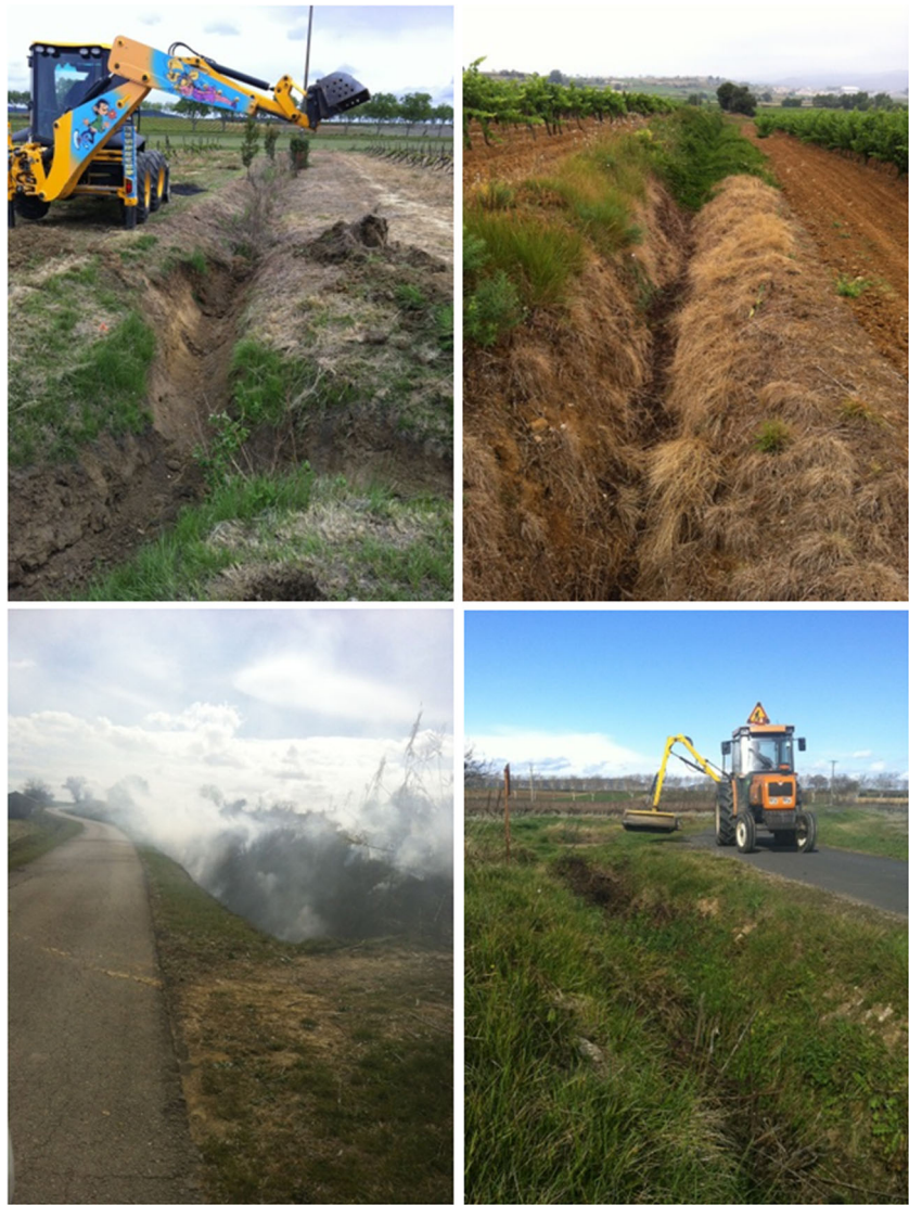
Fig. 1 Ditch maintenance. Ditch maintenance is a combination and a succession in time of four basic operations namely dredging, mowing, chemical weeding, and burning. On top : dredging on the left and chemical weeding on the right . On the bottom : burning on the left and mowing on the right . Note that ditch maintenance operations exert a strong influence on several important ditch characteristics and, in turn, the provision of ecosystem services

The main aim of this review is to determine whether and how the design of ditches and their maintenance can be useful for the agroecological engineering of landscapes. In this respect, three successive questions are addressed: