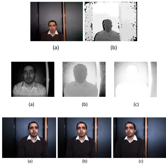
Figure 1: Top row: example of infrared sensor images (Kinect): (a) color image (b) depth image. Middle row: example of TOF sensor images (SR4000): (a) infrared image (b) depth image (c) confidence matrix (bright pixels show high confidence). Bottom row: example of image triple acquired with the stereo camera (Bumblebee XB3)

and two bimodal 2D-3D collections (FoxKinect and FoxToF). The 3D data for all collections are given as depth maps.