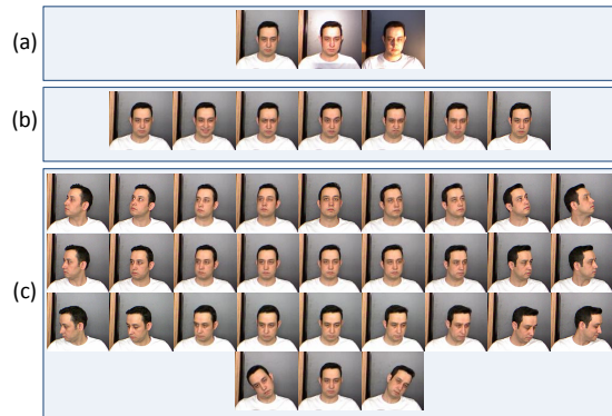
Figure 2: Example of all possible variations for a subject: (a) 3 lighting conditions (b) 7 face expressions (c) 30 head poses.

In total, the collection contains 2560 images. Figure 2 shows an example of all possible variations for a subject. In addition to static images (2D and depth), a video sequence is also recorded for each subject, containing all variations, for the three datasets FoxStereo, FoxKinect et FoxToF.