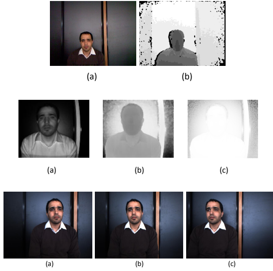
Figure 1: Top row: example of infrared sensor images (Kinect): (a) color image (b) depth image. Middle row: example of TOF sensor images (SR4000): (a) infrared image (b) depth image (c) confidence matrix (bright pixels show high confidence). Bottom row: example of image triple acquired with the stereo camera (Bumblebee XB3)

and two bimodal 2D-3D collections (FoxKinect and FoxToF). The 3D data for all collections are given as depth maps.