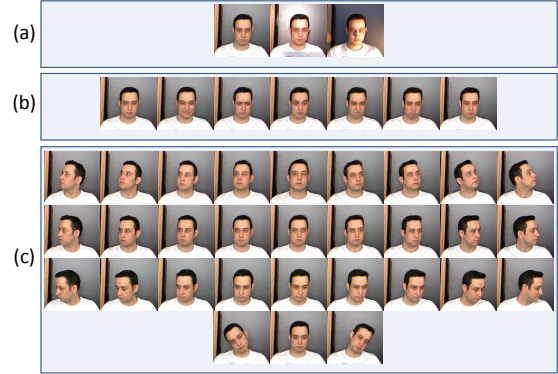
Figure 2: Example of all possible variations for a subject: (a) 3 lighting conditions (b) 7 face expressions (c) 30 head poses.

In total, the collection contains 2560 images. Figure 2 shows an example of all possible variations for a subject. In addition to static images (2D and depth), a video sequence is also recorded for each subject, containing all variations, for the three datasets FoxStereo, FoxKinect et FoxToF.