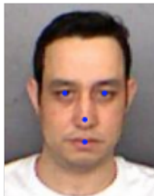
Figure 3: Annotated interest points on a face.

shows annotated point on a face from the dataset. All images are given a label that encodes the following information: subject id, image id, pose, lighting condition, face expression, image type (2D, depth).