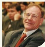
Professor at the University of Paris IV-Sorbonne ; President of the journal Population & Avenir.

tility level is lower. Their budgetary choices, such as the granting of allowances already for the first child in Germany, do not seem optimal, while other elements, of a cultural nature, contribute to a weakened fertility.