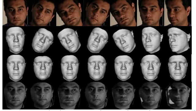
Fig. 4. Examples in UHDB. First row is raw image; second and third rows illustrate respectively the recovered face shape with and without estimated pose; last row shows the textured image after pose normalization. In particular, first column is gallery and others are probes.

As shown in Table. 1, the proposed method is compared with two previous work on UHDB [12]. Furthermore, another comparison experiment without RF based pose estimation is carried out as well for validating the efficiency of progressive pose estimation for pose-invariant face recognition. In the meanwhile, their computation complexities are also