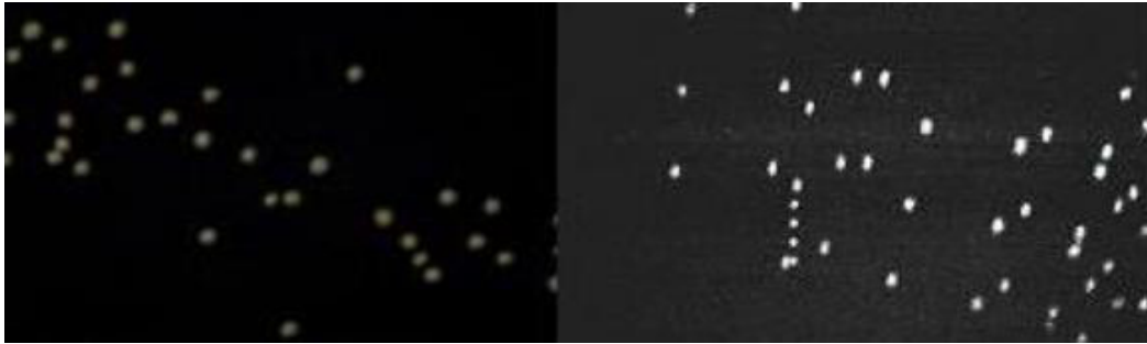
Fig. 1. Particle images for the high speed (left) and stroboscopic (right) imaging technique.