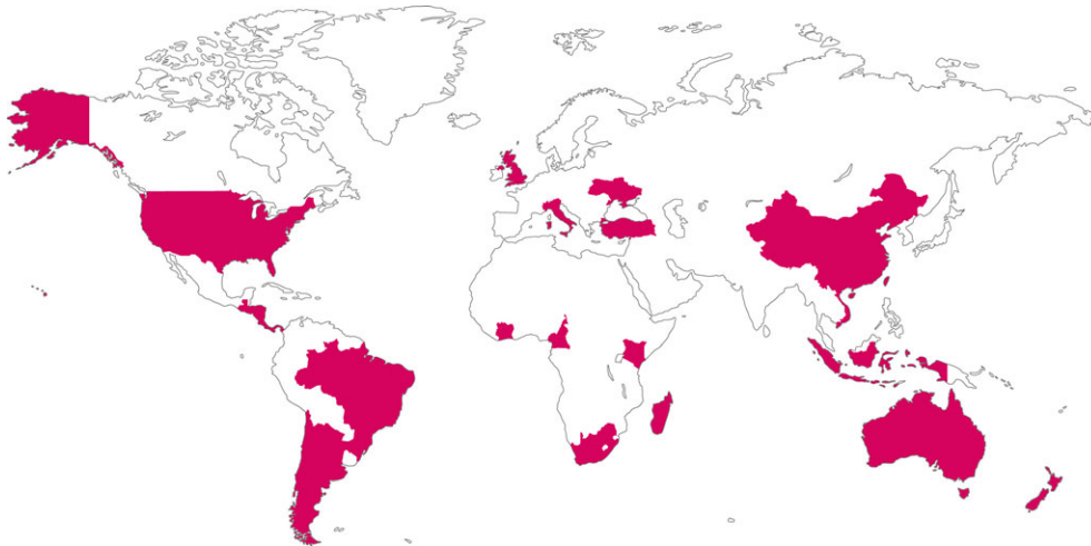
Figure 1. Countries participating in the Global Influenza B Study. April 2014.

The proportion of influenza cases due to type B virus was <20% for 90 seasons, 20–50% for 82 seasons and \geq 50% for 28 seasons; the median percentage was 22.6% (IQR 8.3–37.7%). Figure 2 shows the distribution of seasons according to the proportion of influenza cases caused by type B virus, separately for countries situated in the Northern or Southern Hemisphere or in the intertropical belt. The median proportion of influenza B over all influenza seasons was 17.8% in the Southern Hemisphere (IQR 3.5–30.4%; 39 seasons), 24.3% in the intertropical belt (IQR 10.2–40.8%; 94 seasons), and 21.4% in the Northern Hemisphere (IQR 7.3–38.0%; 67 seasons). The P -value for the comparison of the median proportion of influenza B in the Southern Hemisphere versus the intertropical belt was borderline significant (0.07) and not significant for the other comparisons.