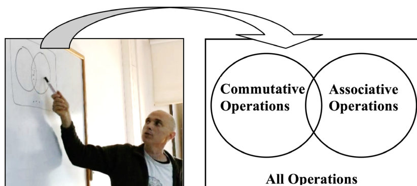
Figure 3: A teacher presenting the mathematical idea of the episode using set theory

A major discussion evolved around the use of operation tables to exemplify operations that satisfy only one of the two properties. Some teachers asserted that operations on small finite groups are not equivalent, both mathematically and pedagogically, to operations defined on the real numbers. The discussion facilitator asked the teachers to consider the advantages and disadvantages of the teacher’s choice of operations. The advantages offered by participants were that (a) these examples clearly serve the teacher’s apparent goal – challenging what students erroneously perceive as obvious; (b) the process of considering these operations and checking which properties they hold may contribute to the development of critical thinking, which is another goal that can be ascribed to the teacher; (c) using such examples conveys that operations