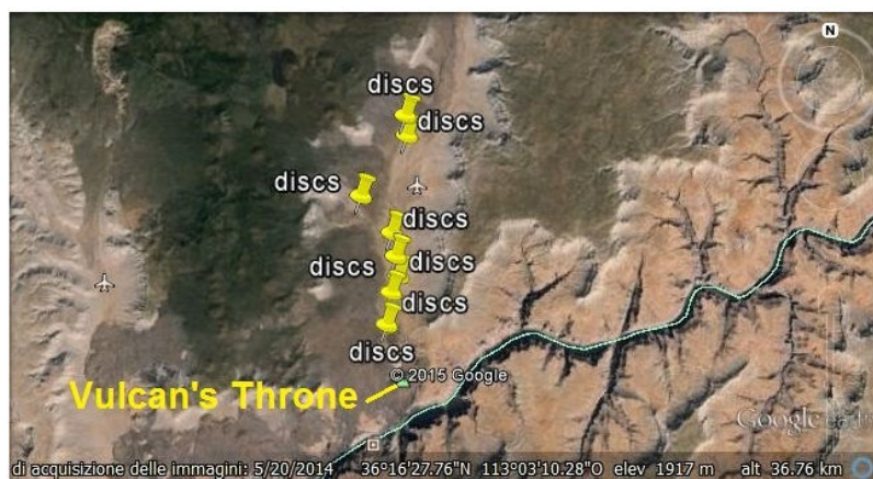
Figure 3. The markers show a large area, 10 km long, in the Toroweap Valley of the Grand Canyon, where it is possible to observe a patterned vegetation, like that given in the following Figure 3.

In the Figure 3, the markers are showing a large area, near the Grand Canyon rim, where, using Google Earth, we can see a patterned vegetation like that given in the Figure 4. The patterned vegetation has a “polka-dot” arrangement of discs (the pattern is given in images with smaller scales). The irregularity of the polka-dot pattern excludes an unnatural origin.