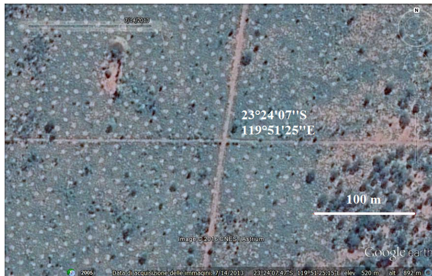
Figure 2. Vegetation pattern as seen in Google Earth satellite image of 14 July 2013, of a location in Australia. This is an example of “fairy circles” pattern outside Namibia given in [16].