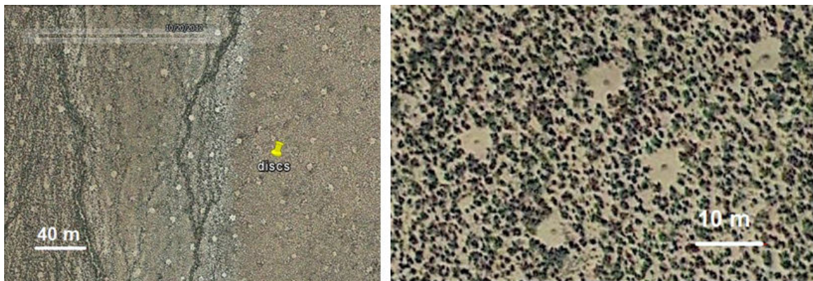
Figure 4. On the left, the patterned vegetation having a “polka-dot” arrangement (Courtesy Google Earth, coordinates: 36°15'19.18” N, 113° 04' 55.38” W). On the right, the “dots” are shown in detail (Courtesy Google Earth, coordinates: 36°14'55.07” N, 113°05'05.22” W). The sites are in the Toroweap Valley of the Grand Canyon.

In a previous discussion, proposed in [21], we compared the discs in the Figure 4, with a red harvester ant nest sketched in Ref.22. Comparison told that they are probably nests of these ants. However, since the dryland ecosystems can exhibit patterns of vegetation created by the competition among individual plants [23], in [21] it was stressed the importance of a local investigation. In fact, after publications [21,24], Robert Nagell, Doctor of Veterinary Medicine, [25], visited the area of Toroweap Valley of Arizona, confirming that spots are ant mounds. In his courtesy pictures, here adapted in Figure 5, it is visible the cone of the nest and the surrounding area cleared of vegetation. Then, the area of “polka-dot” vegetation of Toroweap Valley represents a remarkable large surface occupied by such colonies of ants.