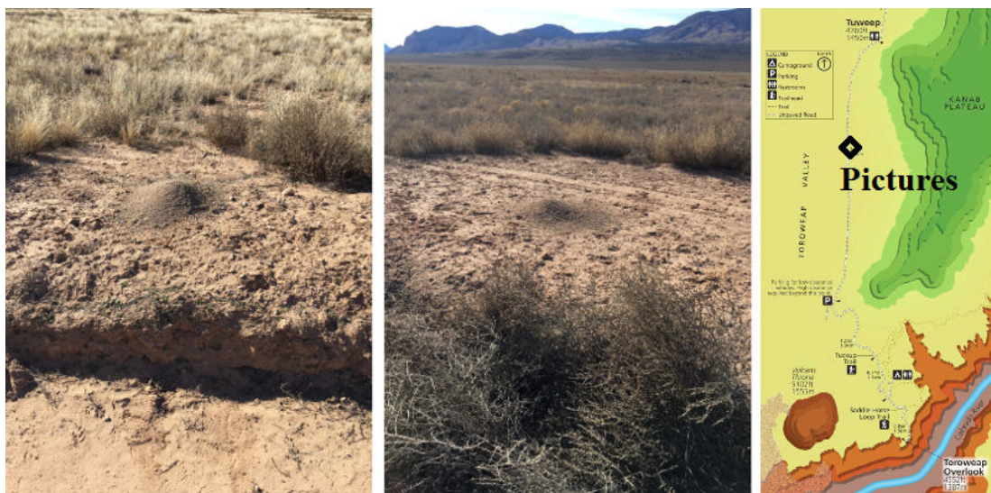
Figure 5. After visiting the Toroweap Valley of Arizona, Robert Nagell, Doctor of Veterinary Medicine, confirmed that spots are ant mounds. In his courtesy pictures, it is visible the cone of the nest and the surrounding area cleared of vegetation.