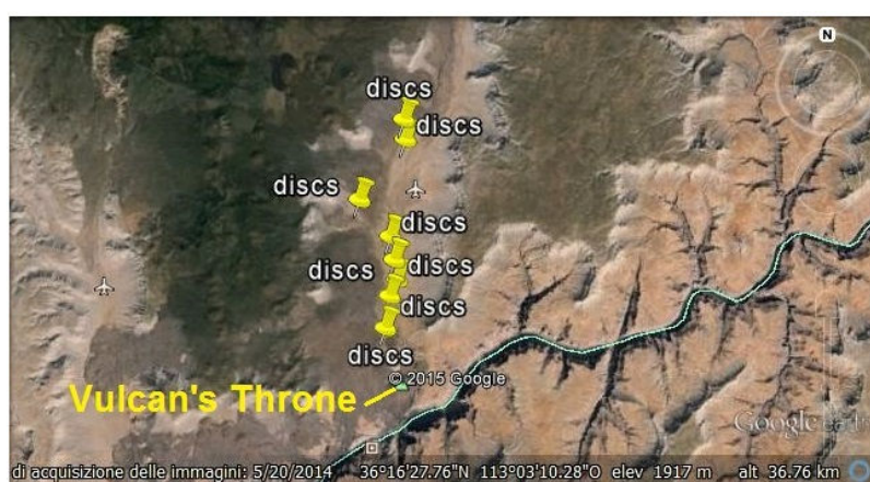
Figure 3. The markers show a large area, 10 km long, in the Toroweap Valley of the Grand Canyon, where it is possible to observe a patterned vegetation, like that given in the following Figure 3.

In the Figure 3, the markers are showing a large area, near the Grand Canyon rim, where, using Google Earth, we can see a patterned vegetation like that given in the Figure 4. The patterned vegetation has a “polka-dot” arrangement of discs (the pattern is given in images with smaller scales). The irregularity of the polka-dot pattern excludes an unnatural origin.