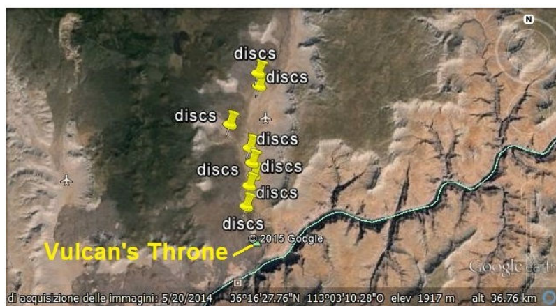
Figure 3. The markers show a large area, 10 km long, in the Toroweap Valley of the Grand Canyon, where it is possible to observe a patterned vegetation, like that given in the following Figure 3.

In the Figure 3, the markers are showing a large area, near the Grand Canyon rim, where, using Google Earth, we can see a patterned vegetation like that given in the Figure 4. The patterned vegetation has a “polka-dot” arrangement of discs (the pattern is given in images with smaller scales). The irregularity of the polka-dot pattern excludes an unnatural origin.